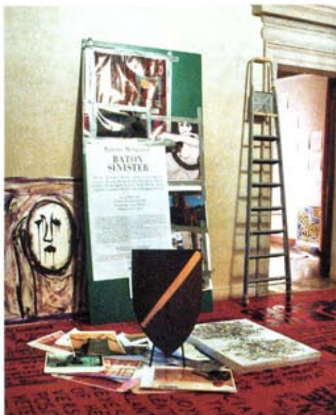
From left: View of "Baton Sinister," 2011, an exhibition by Bjarne Melgaard and students, Palazzo Contarini Corfù, Venice. We: I and Me: He and She, 2011, oil on canvas, 69 x 61". Installation view, Palazzo Contarini Corfù, Venice. From "Baton Sinister."